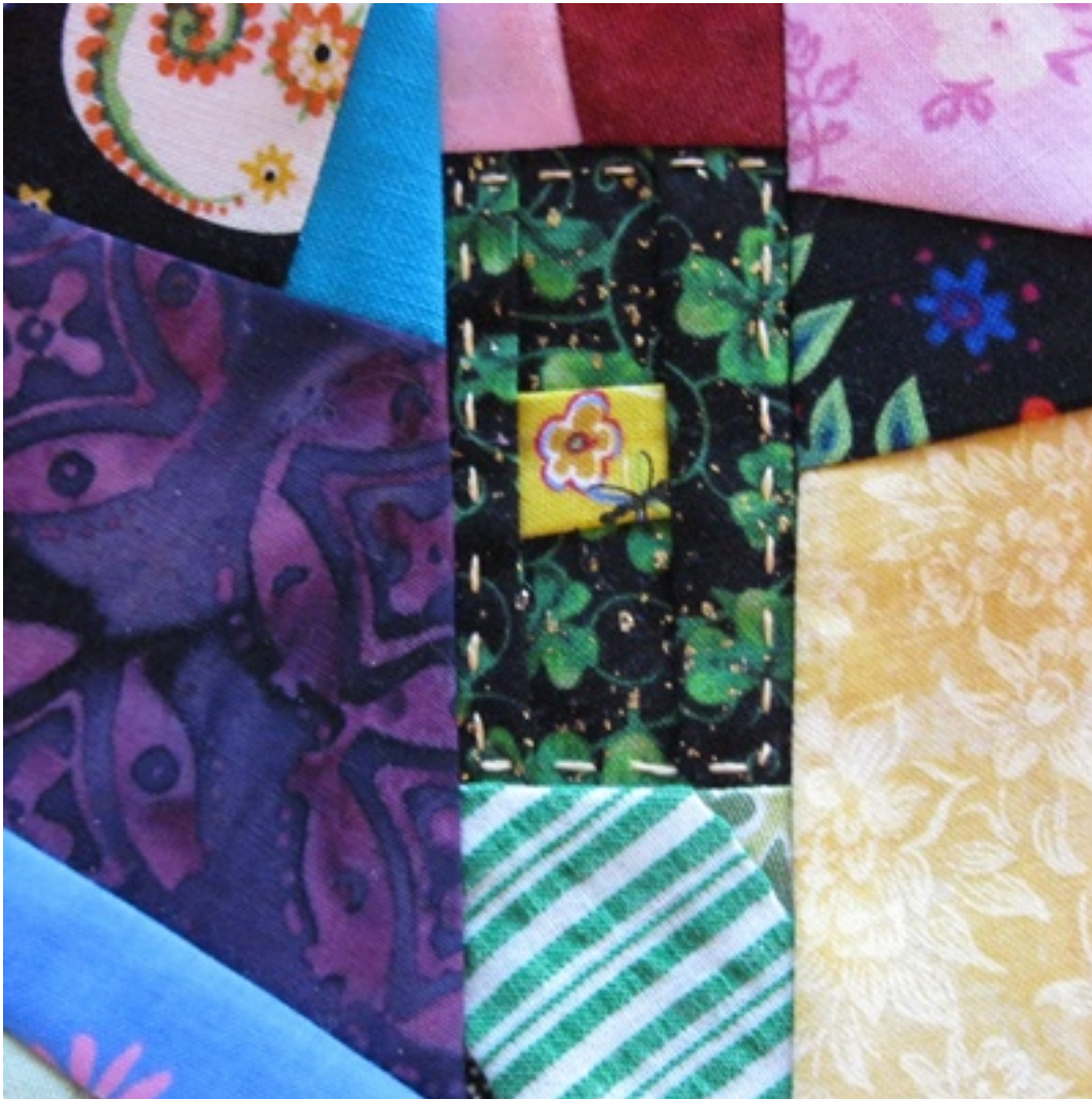
Here is another crazy block with a tiny fussy cut little flower. This flower is about 3/8" square.