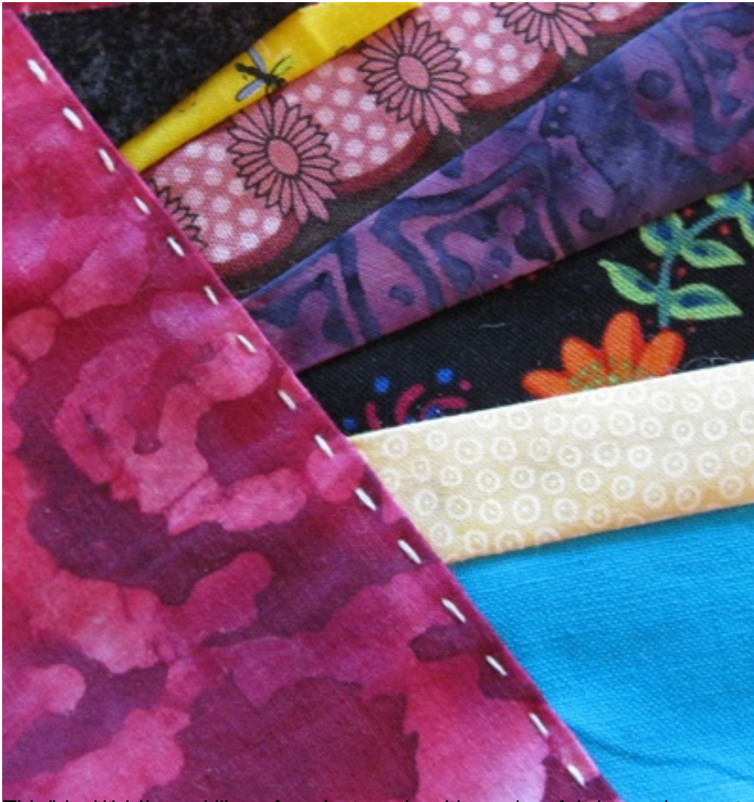
This block is shaped like a fan. Just made with random fabrics and accented with embroidering