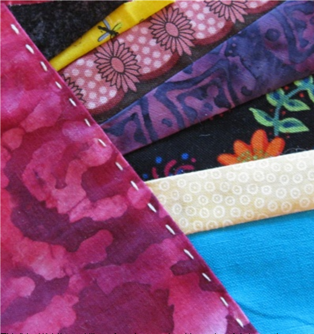
Tunisian blocks shaped like a fan. Just made with random fabrics and accented with embroidering